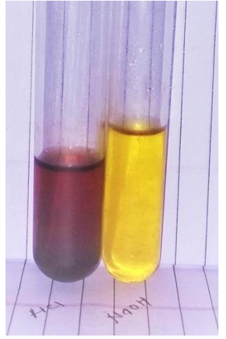
Fig. 2.Indicator colour change in HCl and NaOH