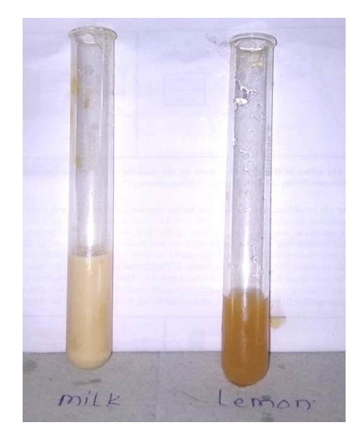
Fig. 4 Real samples like milk, lime juice by addition of indicator

Conclusion: In the present study spathodia alcoholic extract was used as natural indicator for acid base titration and pH indicator strip as base alternative for litmus paper. The preparation of indicator and pH strip is very easy and students friendly which can easily applied to collage laboratory. The color change in acidic and basic condition for extract and strip is pink and blue having about \lambda max- 530 nm and \lambda max- 400 nm respectively the pH strip can use for various applications as primary determination. Finally it may be concluded that the prepared indicator is green natural economical and better alternative to synthetic indicator and litmus paper.